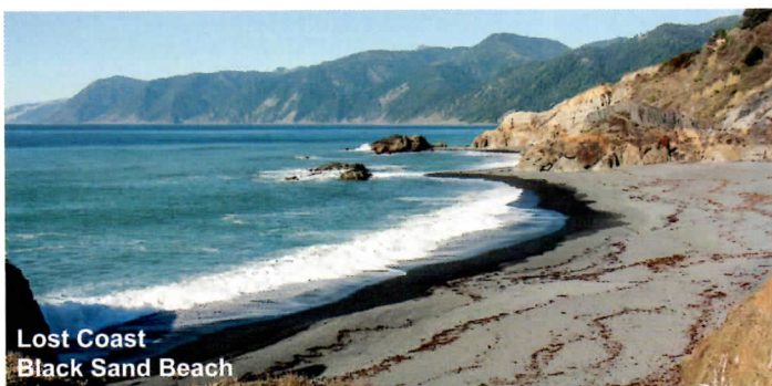
Lost Coast Black Sand Beach