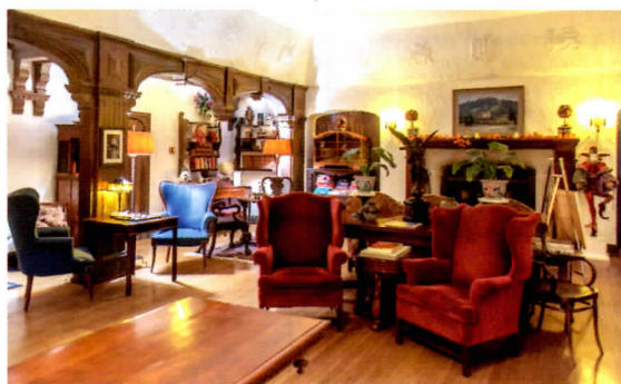
Benbow Inn Lobby

Local excursions into the surrounding Redwood Coast may include hikes among the giant coastal redwoods and visits to small Victorian towns. Just six miles north of the Benbow Inn is a 31 mile amazing drive along the Avenue of the Giants. These trees form their own lofty cathedrals as light filters through old growth groves down to the carpets of ferns and moss. Don't miss the special Drive Through Tree.