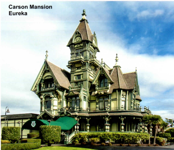
Carson Mansion Eureka