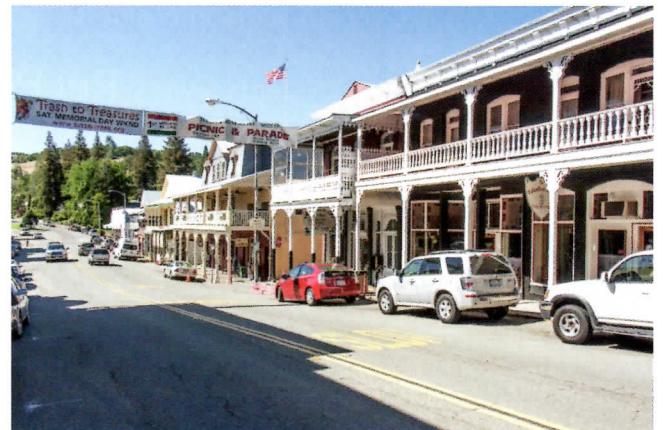
Main Street, Sutter Creek

The nearby Greenhorn Creek Resort offers comfortable accommodations to golfers and non-golfers alike with its luxurious condos, lovely