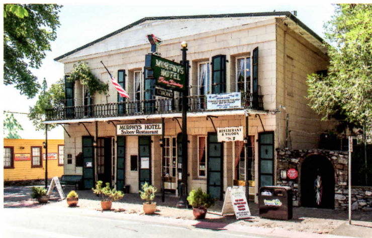
Murphy's Historic Hotel (1856)

Of course, there are almost infinite numbers of gorgeous wineries to visit and wines to sample. Award-winning Ironstone Vineyards, in addition to tastings, offers tours, concerts, picnic areas, and