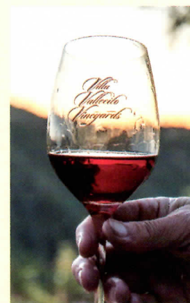
Villa Vallecito Winery

a look at their "Crown Jewel," a 44 pound crystalline gold specimen in their Heritage Museum. Want a taste of heaven in both wines and location? Visit Villa Vallecito which is perched atop a secluded peninsula. You can overnight in their casita, luxuriously decorated with Mexican designs, soak in the pool and spa while overlooking New Melones Reservoir and the rolling Sierra Foothills. On this trip, I learned to handle a jumping frog and pan for gold. I also enjoyed the delicious wines, cuisine, and hospitality of California's Gold Country. Gold takes many forms.